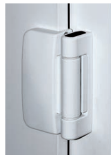
Flag hinges enhance the appearance of your door and offer micro adjustment in three directions.